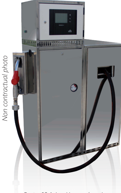
Boxter 10 Avia - Hose reel version

Robust and compact, fruit of the 25 years of Lafon's experience, BOXTER AVIA was designed to optimize the profitability of your airfield refuelling station.